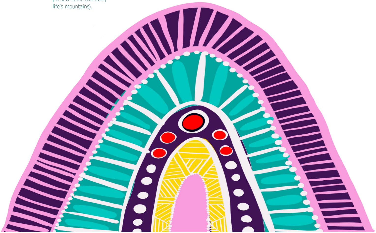
The mountain represents resilience, strength and perseverance (climbing life's mountains).